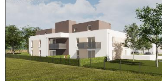
Etage 1 Lot 11-T2